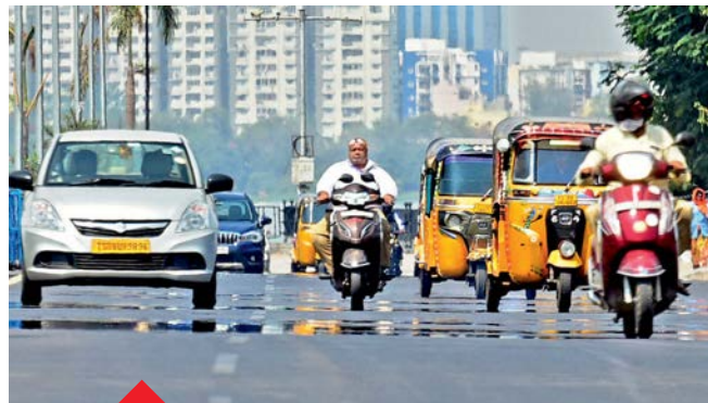
A mirage forms on the road in the afternoon as vehicles drive by in Hyderabad on Wednesday.