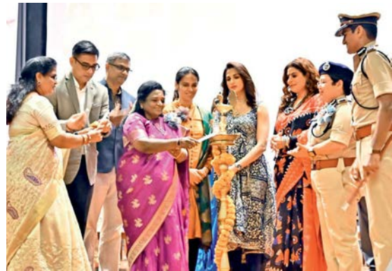
Governor Dr Tamilisai Soundararajan lights the lamp to mark the inauguration of a seminar on women organised on the occasion of 'International Women's Day' celebrations organised at BITS Pilani campus in Shamirpet on Wednesday.

who came here are part of the police department and are appreciated for their contribution to society. Women can work effectively not only as doctors, lawyers and teachers but also as police officers. During counselling of women victims of domestic violence and marital disputes, female police officers can perform a variety of duties," the Governor said.