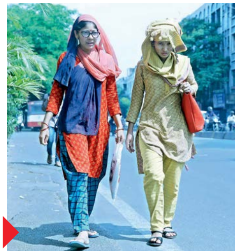
Women cover their heads to protect themselves from intense heat in Hyderabad on Wednesday.